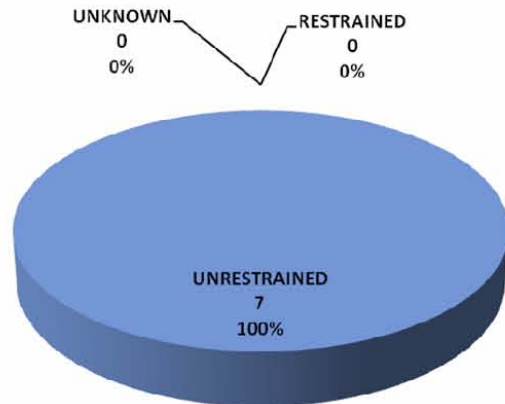
2008 Fatality by Restraint Use

Passenger Vehicles Include Light (P/U) Trucks & Passenger Cars