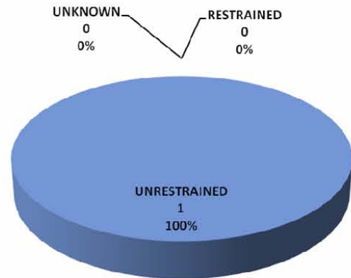
2008 Fatality by Restraint Use

Passenger Vehicles Include Light (P/U) Trucks & Passenger Cars