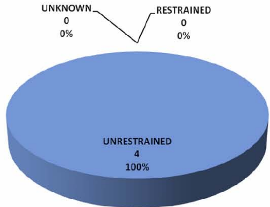
2008 Fatality by Restraint Use

Passenger Vehicles Include Light (P/U) Trucks & Passenger Cars