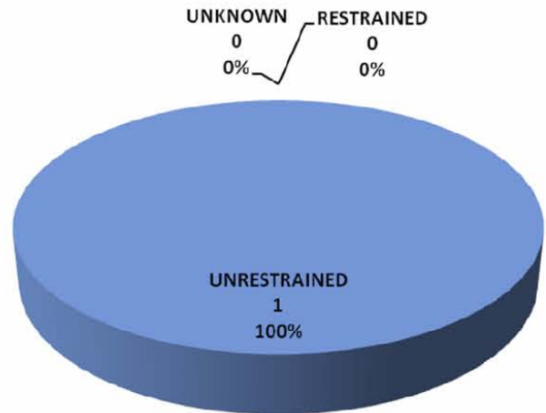
2008 Fatality by Restraint Use

Passenger Vehicles Include Light (P/U) Trucks & Passenger Cars