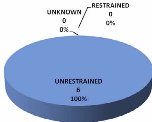
2008 Fatality by Restraint Use

Passenger Vehicles Include Light (P/U) Trucks & Passenger Cars